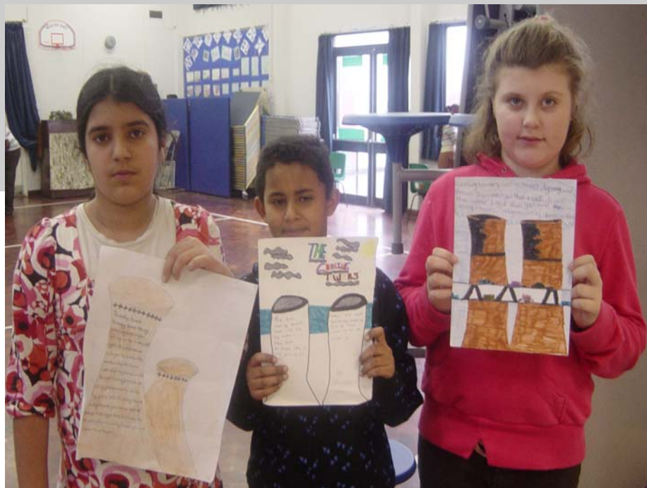
Some of the Tinsley Junior School Cooling Towers Art competition winners

spread wider to get the views of people in the rest of Sheffield, and beyond. As a celebration of the Cooling Towers Go Sheffield are planning to set up a shop in the city centre selling Cooling Tower's plates, mugs and T-shirts during April.