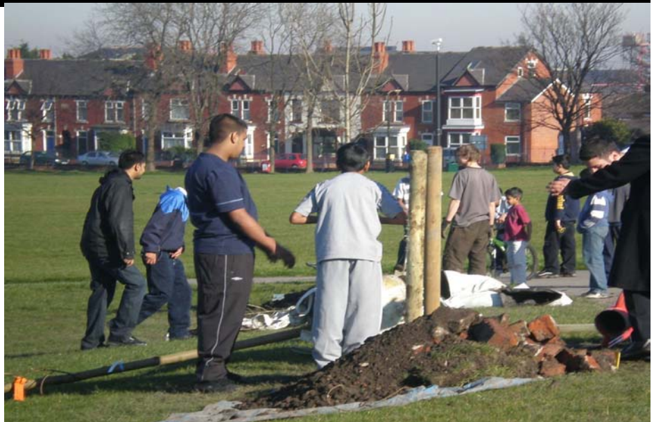
Tree planting on Tinsley Green earlier in the year